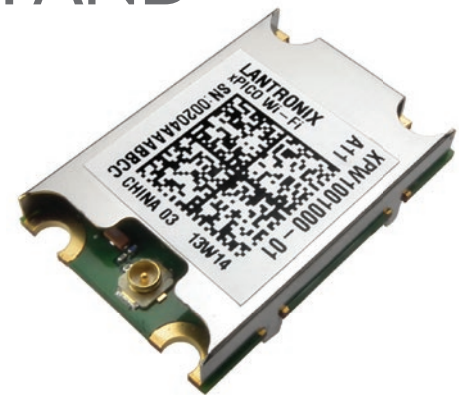
xPico Wi-Fi Actual Size

As one of the smallest embedded device servers in the world, xPico Wi-Fi can be utilized in designs typically intended for chip solutions, befitting in advantages to cost and time-to-market. Its “zero host load” eliminates any need for drivers on the connected microcontroller making implementation easy and fast with virtually no need to write a single line of code. This translates to considerably lower development costs and faster time-to-market. As xPico Wi-Fi meets FCC Class B, UL and EN EMC and safety compliance, your development time is shortened. xPico Wi-Fi can reduce the overall cost of ownership compared to the competition.